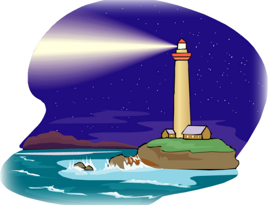
Let the light of truth and love shine into the dark world around you.

Is this how the world acts? Does the world walk in the love of YHVH? No, but this is how the children of YHVH, his set-apart people, are to act. This is how we can be a light to the world and bring hope to the world by showing them the way of love. We