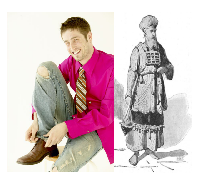
Holey clothes OR holy/set-apart robes of righteousness??

What is holiness? YHVH is holy or set-apart/kadosh, and he wants his people to be set-apart as he is (Leviticus 19:1). Why? So he can have fellowship with us! It's all about having a loving