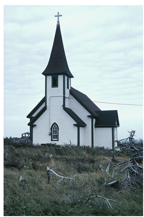
This is NOT the church!

"You are the [spiritual] temple of Elohim ... wherefore come out from among them [the world/heathen], and be separate," says YHVH,