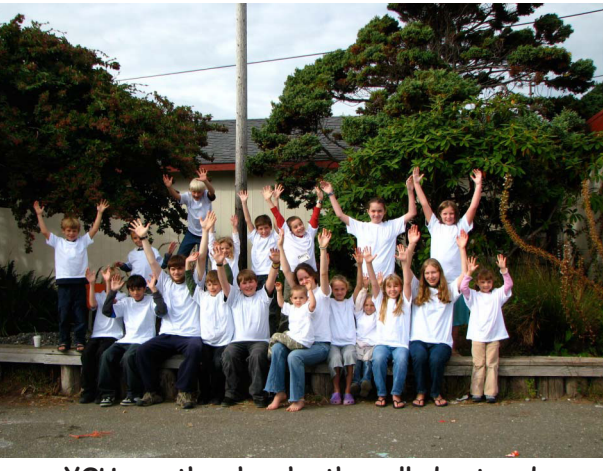
YOU are the church—the called out and hand-picked ones of YHVH!