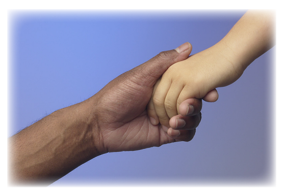
Fear not! Trust and obey.

should we doubt him, or just do it trusting him to make it possible for us to do what he told us to do, and trusting him that he will destroy our enemies and any obstacles before us that would try to hinder us? (Read Deuteronomy 1:30.) Did YHVH take care of the Israelites in the wilderness? (Note verses 31,33.) Will he take care of us today as he took care of our forefathers so long ago?