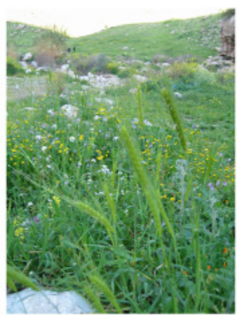
Barley growing wild in Israel

(h) Exodus 9:31 tells us which crop was green in the ear or head. Read that verse again. What grain crop was "in the ear" or aviv?