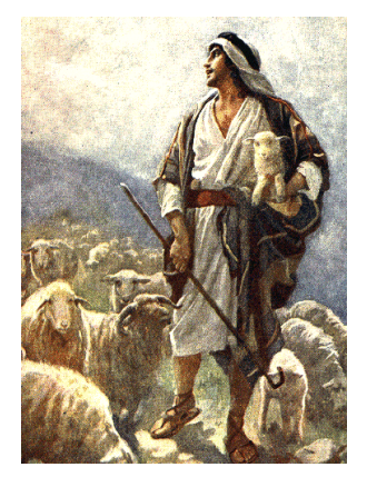
Are you IN Yeshua?

Only by having a living and active relationship with Yeshua through