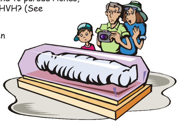
Moses chose between this (above) or this (below), and it changed how he'd be remembered in the future.

Think about it for a moment. If Moses had chosen to continue living in Pharaoh's palace, he might have become king over Egypt. Even if he had not become king, he still would have had untold wealth, fame and power in Egypt during his lifetime. But who would have remembered him after he died? His only claim to fame might have been as a mummy in a museum! How many Pharaoh's do you know the name of? If Moses had become a Pharaoh, how many people would know his name today? Yet how many billions of people over thousands of years have known the name of Moses because he chose to obey YHVH and they have read about him in the Bible?