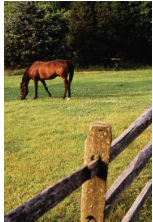
Torah is like a protective fence.